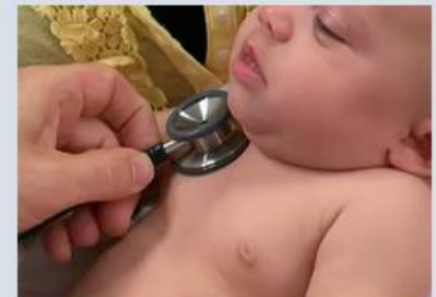
2.9. Thorax and Lungs (2:28)