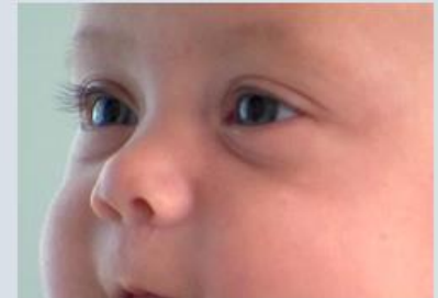
2.6. The Eyes (2:18)