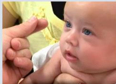
2.7. Ears and Nose (2:01)