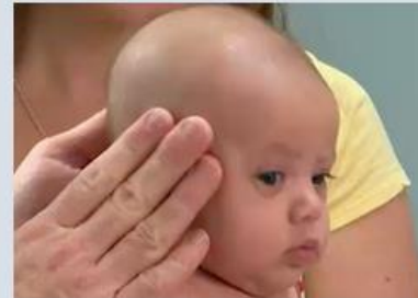
2.5. Head and Neck (2:21)