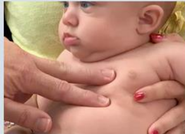
2.4. The Skin (1:42)