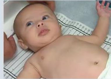
2.2. General Survey and Somatic Growth (3:11)