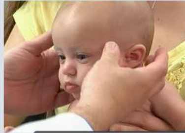
2.1. Introduction (1:44)